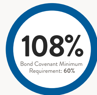
Oakwood Lutheran Senior Ministries Cash-to-Debt Ratio, 2016